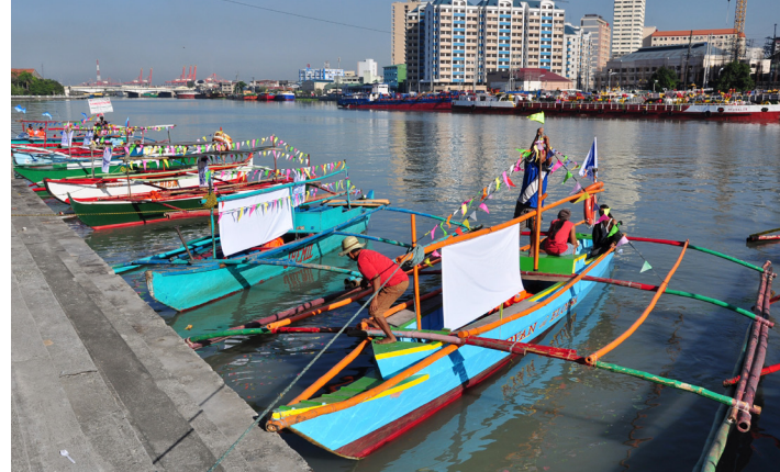
Colorful bancas along Pasig River

· Enforcement of PRRC Task Force Water Hyacinth in conducting massive cleanup and removal of accumulated water hyacinth in the main Pasig River.