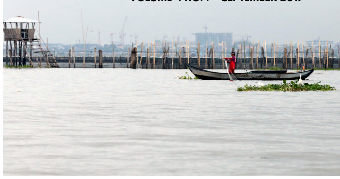
An egret lands on a water hyacinth at Laguna de Bay