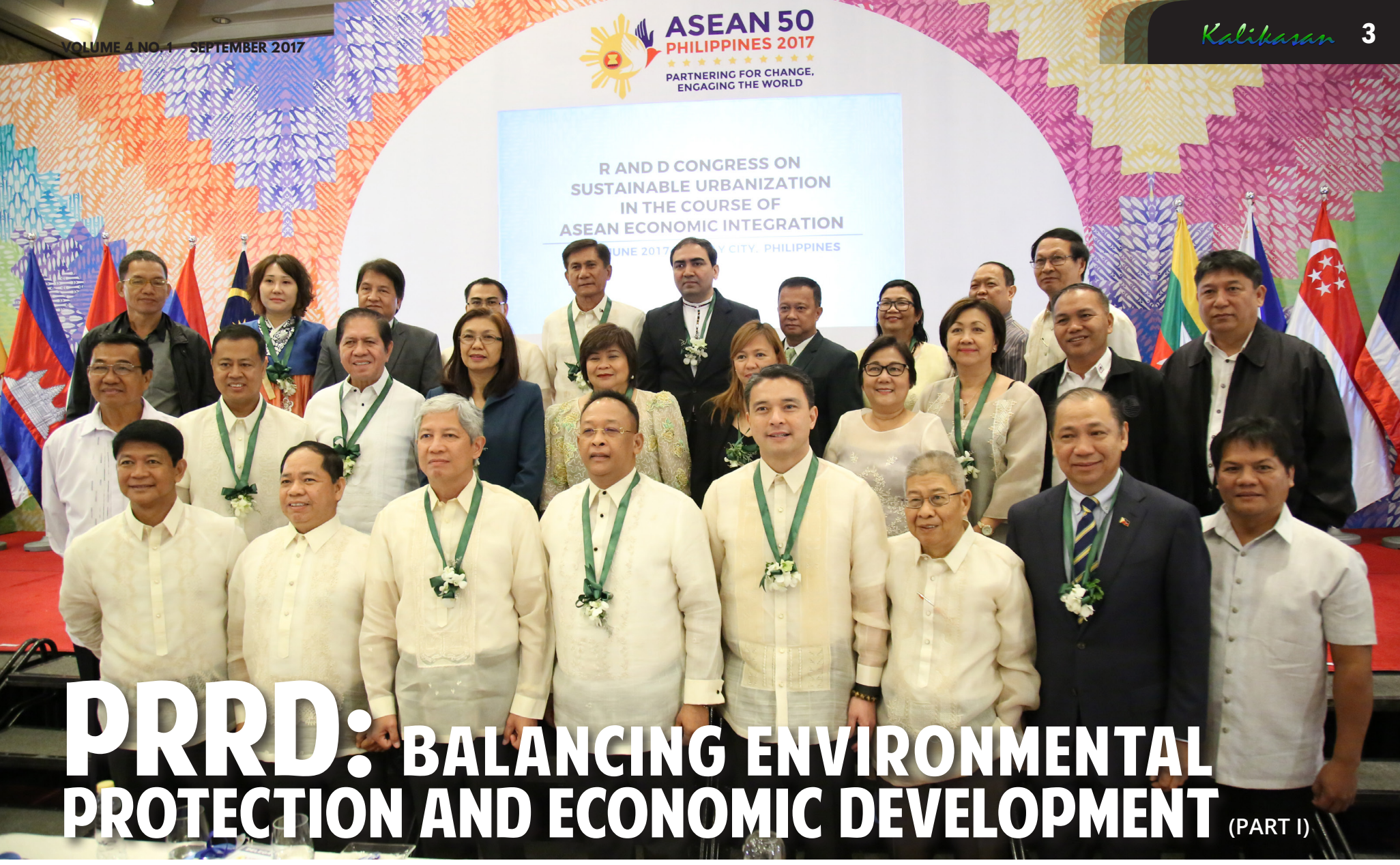
DENR key officials with ASEAN research and development experts (top row) during the Congress on Sustainable Urbanization—ASEAN Economic Integration in Sofitel Manila.

The "Program for Environment and Natural Resources for Restoration, Rehabilitation, and Development" or PRRD will not only address environmental degradation but will also attend to the issues and challenges on environmental protection vis-à-vis economic development